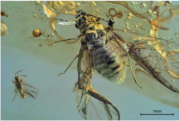
Fig. 2. Rhipidothripoides juttiae sp. n. ♂ (ventral view) close to syninclusions of an aphid and a stellate hair presumably of an oak tree.