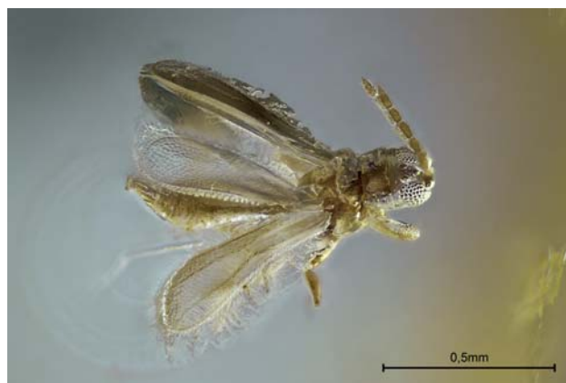
Fig. 4. Mymarothrips groehni sp. n. ♂.

Head wider than long; not produced in front of the eyes. Ocelli and eyes large; compound eyes not distended ventrally. Ocellar setae removed, but at least the points of insertion of two pairs visible; vertex with three pairs of very small postocular setae. Mouth cone short. Maxillary palps 3-segmented. Antennae (Fig. 5) about one third as long as body, 9-segmented; segments III–VII moniliform, but almost rectangular, with prominent setae and slender pedicels at base; VIII cone-shaped; IX slender, forming a slightly cone shaped pedicel. Segments III and IV each with a ventral transverse kidney-shaped sensorium around the apex. Prothorax much wider than long. Pronotum smooth except for some faint lines of transverse sculpture close to the lateral margins; without longer setae except for one pair of prominent posteroangular setae. Pterothorax not clearly visible; at least metanotum transversely sculptured. Forewings typi-