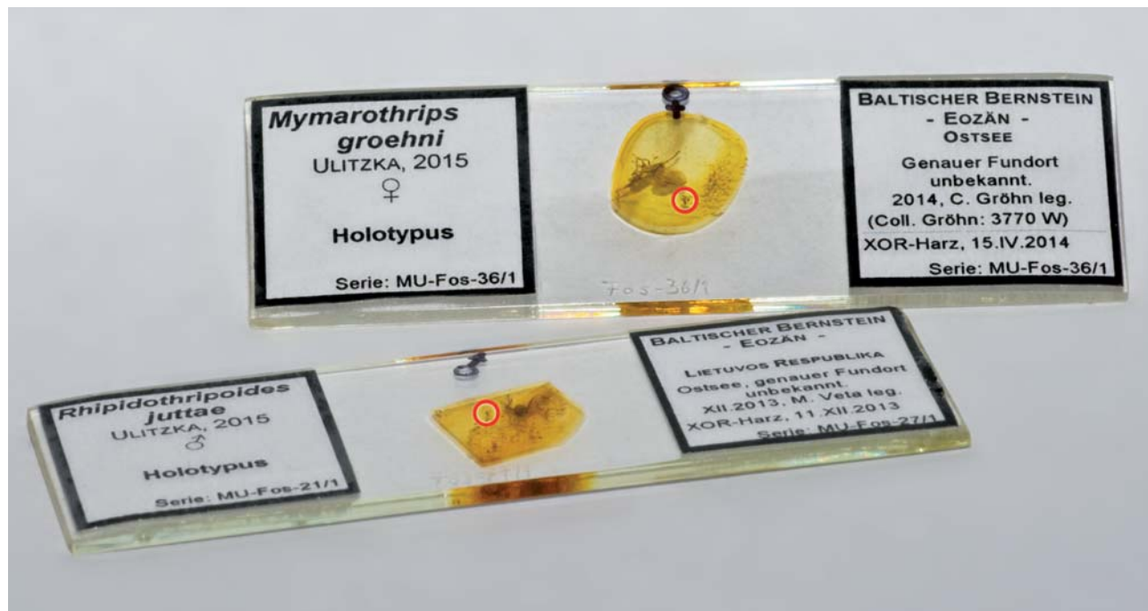
Fig. 1. Microscope slide-like block of polished XOR-Crystal-Resin containing the midway centred amber inclusion of Rhipidothripoides juttae sp. n. and Mymarothrips groehni sp. n. Measurements in mm (length/width/thickness): 76 x 26 x 1.8.

E t y m o l o g y : This gracile species named “ juttae ” is dedicated in love and as a wedding gift to my fiancée and partner for