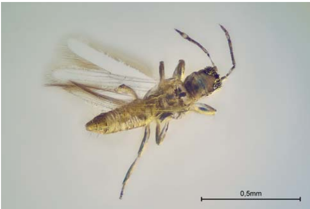
Fig. 3. Rhipidothripoides juttiae sp. n. ♂.

many years, JUTTA MOROZ. She encouraged me countless times to keep on studying thrips species and supports all my scientific work on these insects.